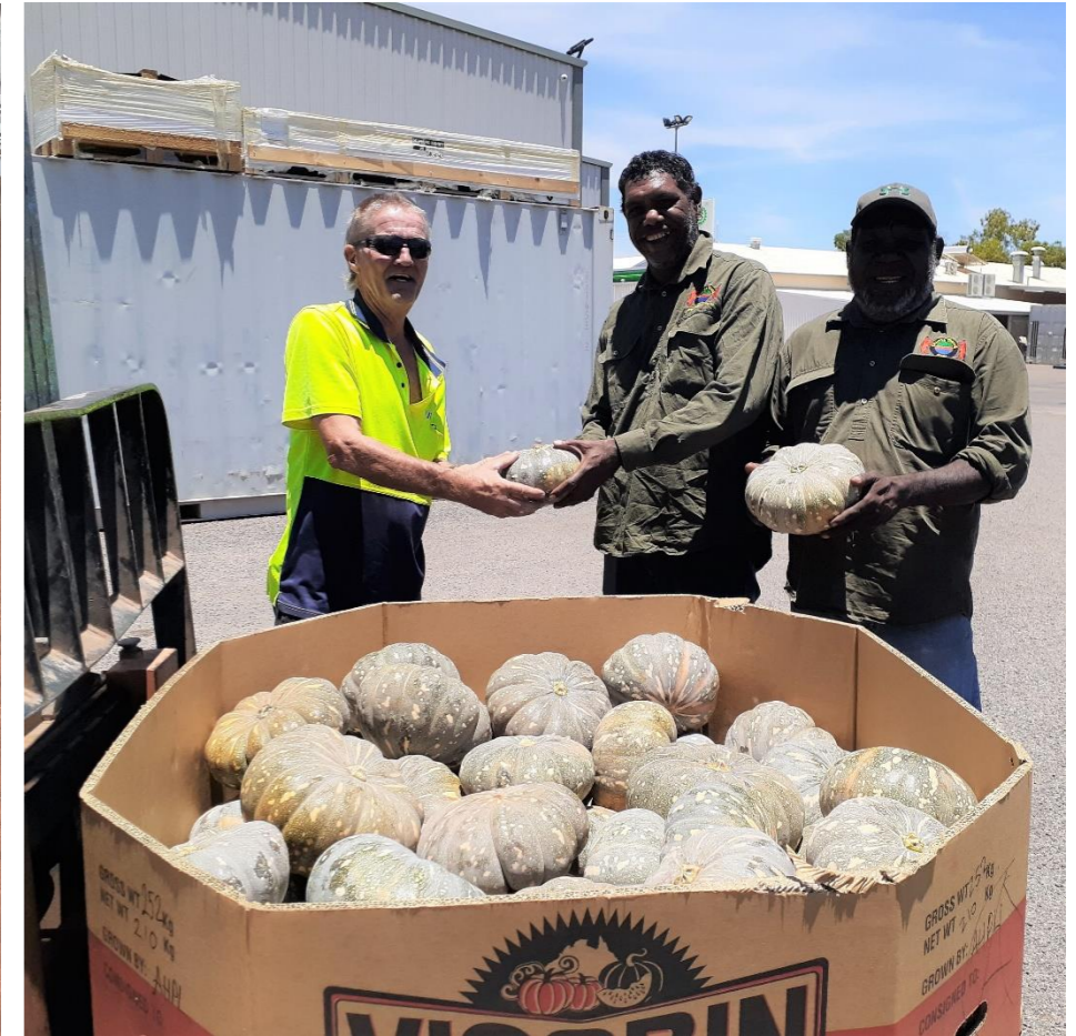
They were sold to Aboriginal-owned IGA supermarkets in both Tennant Creek and Alice Springs, along with the Ali Curung Store (Mirrirri), proving supply chain possibilities between the farm and the market.