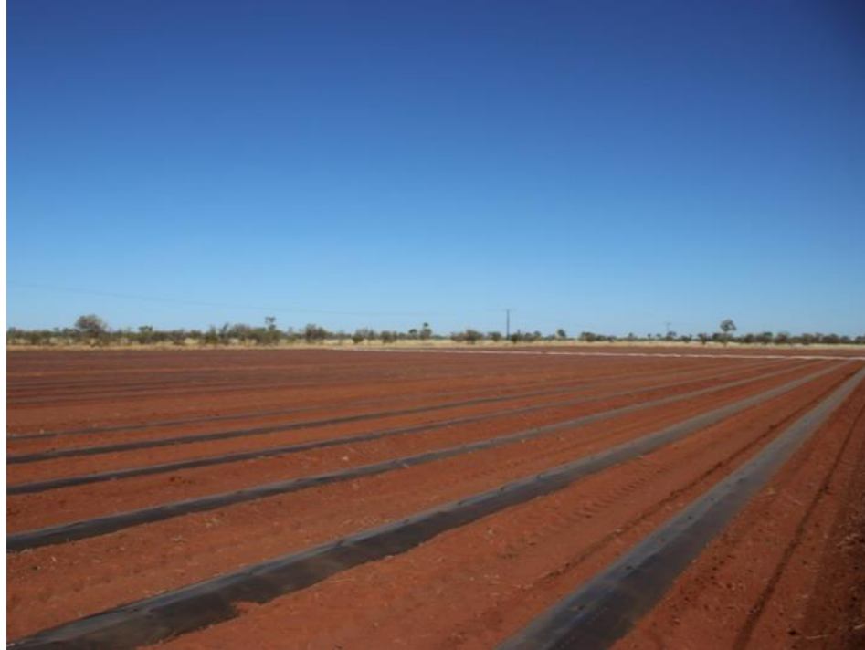
In July 2021 Alekarenge Horticulture and Centrefarm planted 1 hectare of pumpkins at the Work Experience Pathway Project (WEPP). Plantings were done with dripline irrigation under plastic to ensure moisture retention.