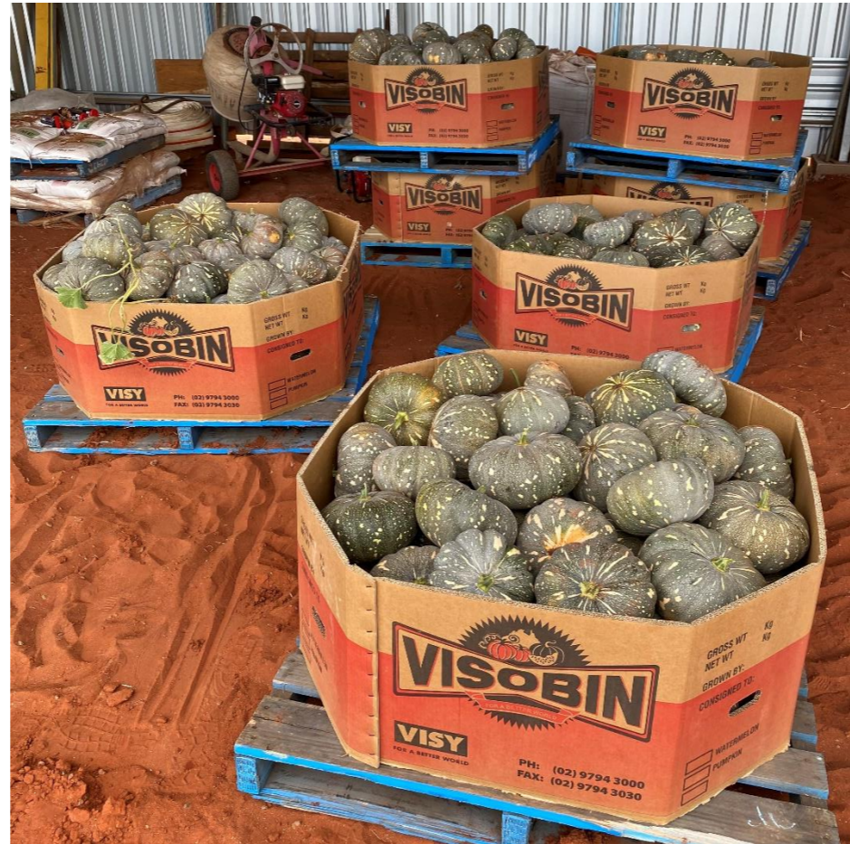
5,509kg of Coventry pumpkins and 3,342kg of Butternut pumpkins were harvested and transported to market.