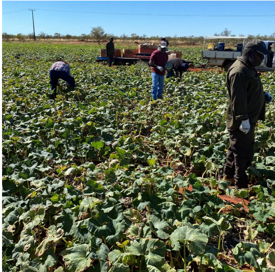
The crop was harvested over 4 days and employed 11 men and women from the Ali Curung community.